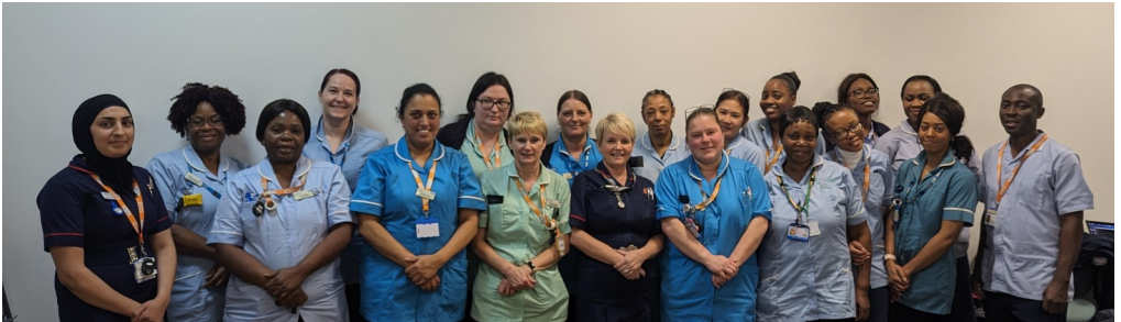
Members of the District Nursing Team

The district nurse can also give you information on the best way to deal with your symptoms and refer you to a specialist service if needed. They also can share details of the support groups that are available to you, your family and carer(s).